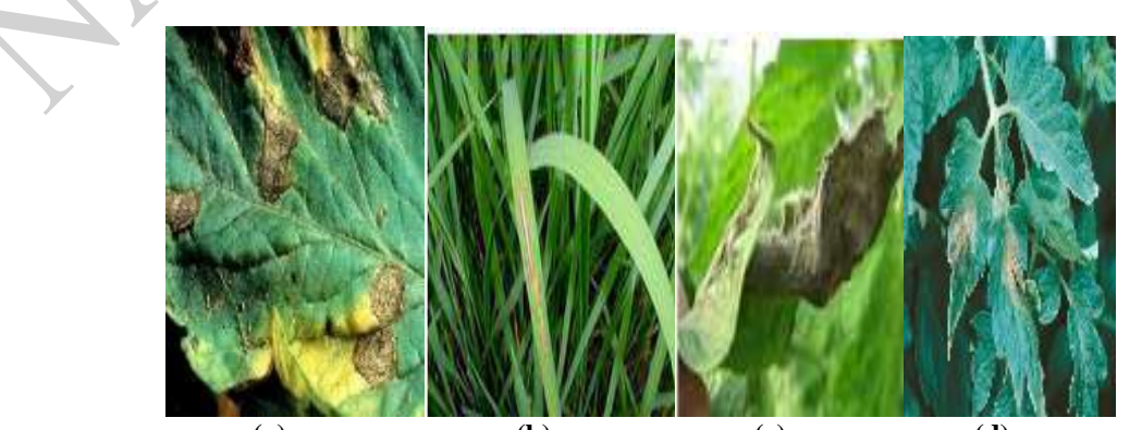
(a) (b) (c) (d) Figure 1: a)Early scorch b) Cottony mold c)Ashen mold d)Late scorch

In the traditional method i.e. naked eye observation required continuous monitoring. But the cost will be more especially with large farms. Farmers have no touch with technology people who can help them. To consult expert's farmers need to pay much. This method is very difficult, time consuming and inaccurate. There are diseases that do not have any visible symptoms and farmers are not having enough knowledge of few diseases, in these cases human vision fails to identify the disease. Diseases occurs due to various reasons like climatic changes, natural disasters, pesticides and by various disease. Below the examples of defected leaves are given in figure 1.